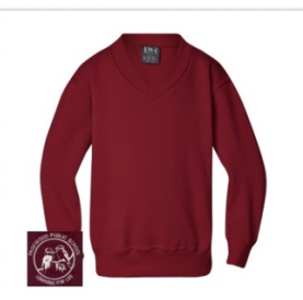
Baudin Fleecy V-Neck Sweat Shirt in Dark...

Worn Monday to Thursday. Sloppy Joe (V-neck) or Jacket (zip up), fleece, maroon