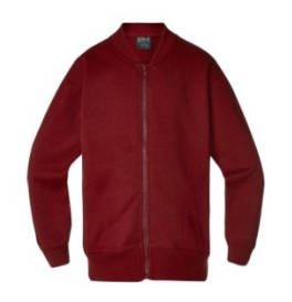
Cunningham Fleecy Zip Jacket in Dark...