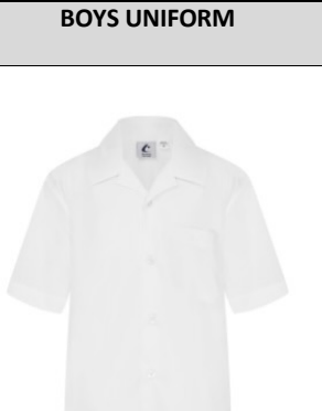
Short Sleeve Shirt with Open Neck Collar in..