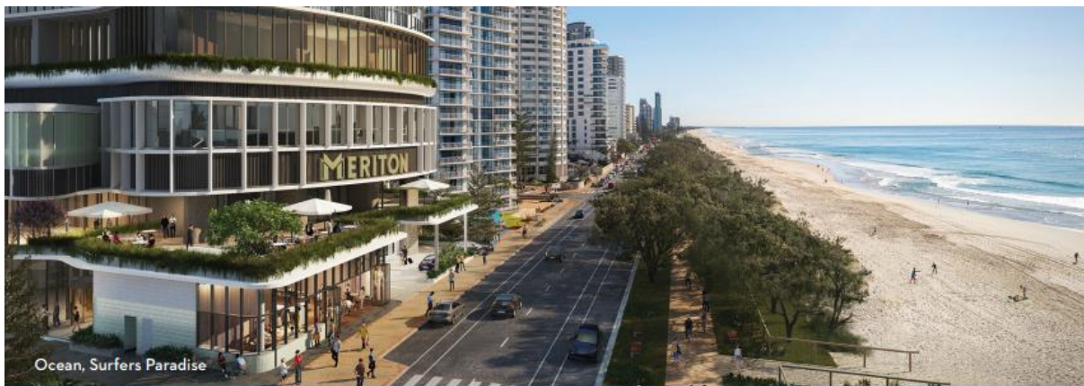
Ocean, Surfers Paradise